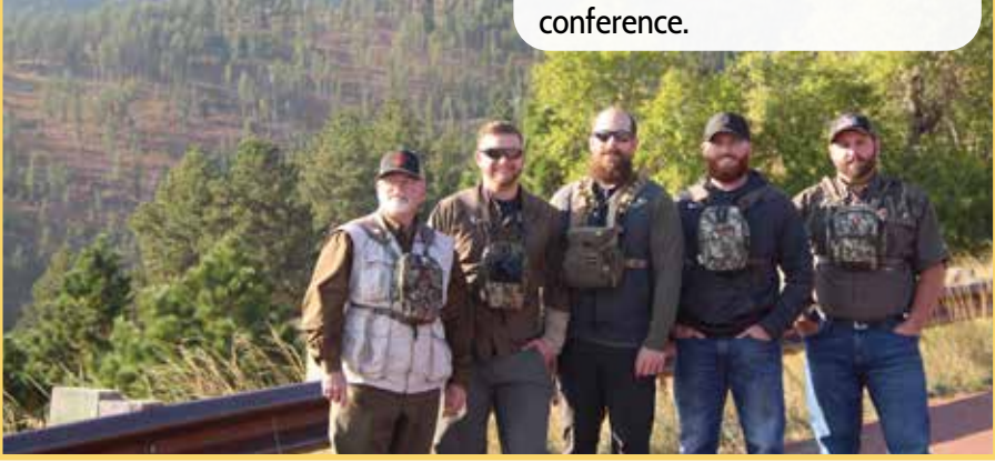
The H&H men visit the Big Horn Mountains in Buffalo, WY for a team building event and conference.