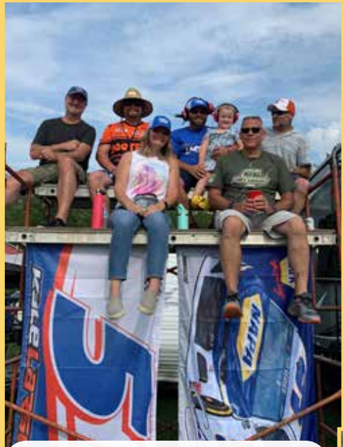
Some of our team camp at Watkins Glen International to watch the NASCAR races in August